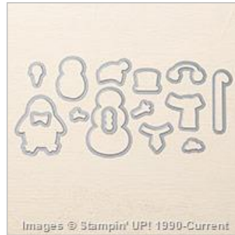
Snow Friends Framelits Dies