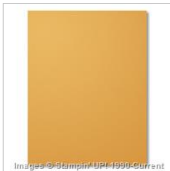
Delightful Dijon 8-1/2" X 11" Cardstock