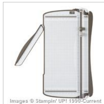
Stampin' Trimmer 126889