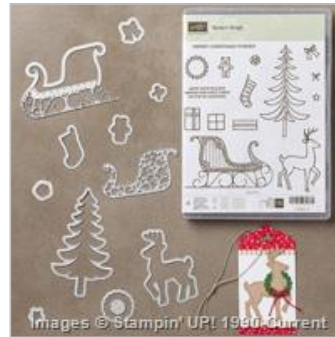
Santa's Sleigh Photopolymer Bundle