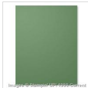
Garden Green 8-1/2" X 11" Cardstock