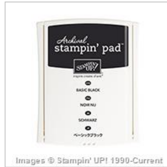
Basic Black Archival Stampin' Pad 140931