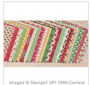
Warmth & Cheer Designer Series