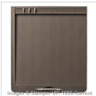
Simply Scored 122334