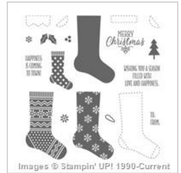
Hang Your Stocking Photopolymer Stamp