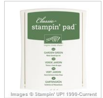
Garden Green Classic Stampin' Pad 126973