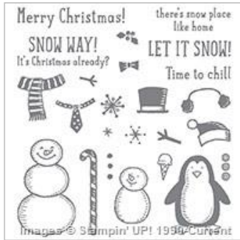
Snow Place Photopolymer Stamp