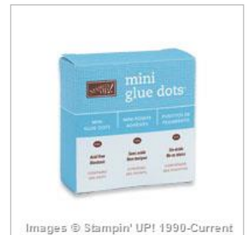
Mini Glue Dots 103683